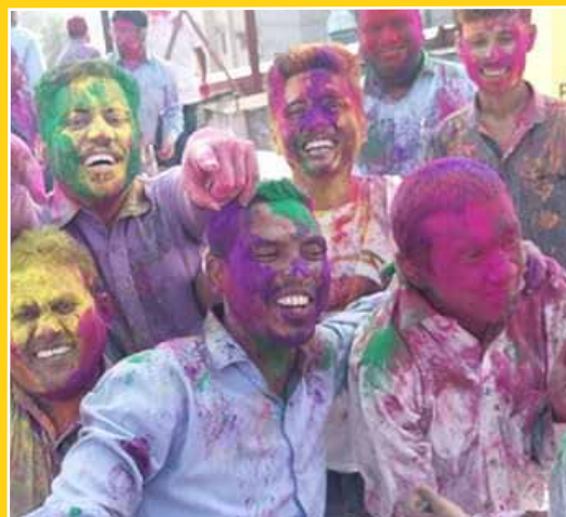
Holi Celebration in Guwahati