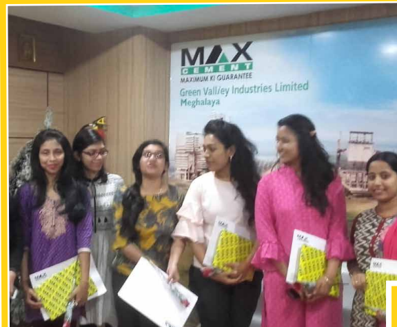
International Women's Day Celebration in Guwahati