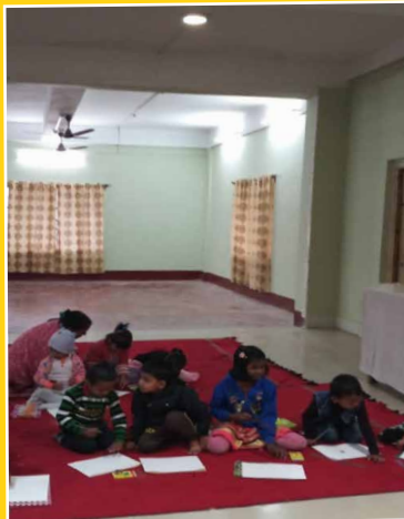
Participants of Drawing Competition