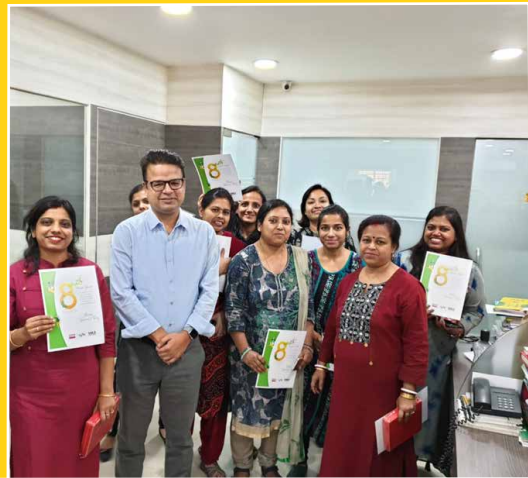
International Women's Day Celebration in Kolkata