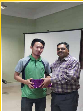
Award distribution for the Drawing, Skit, Poster & Slogan Competition