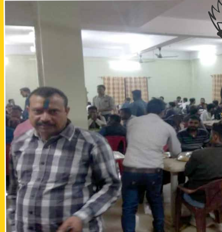
Holi Milan Party