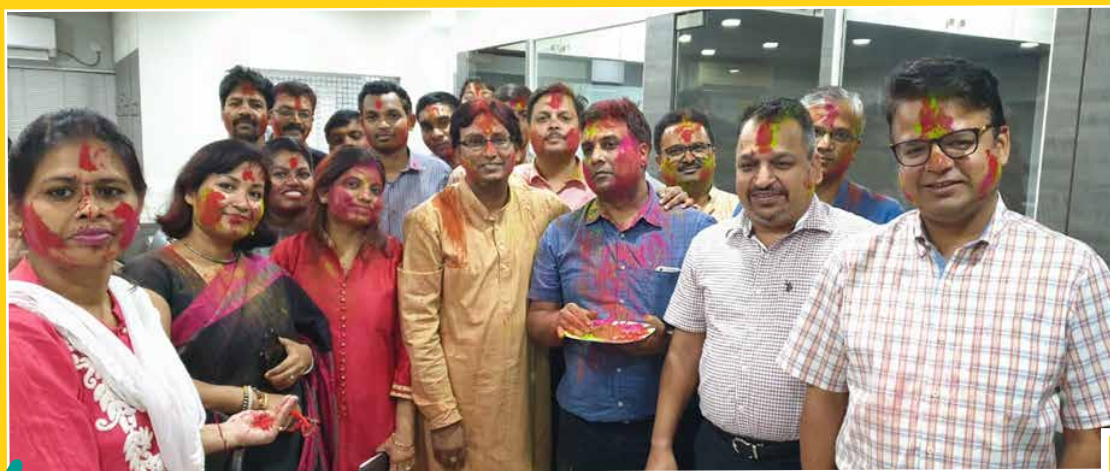
Holi Celebration in Kolkata