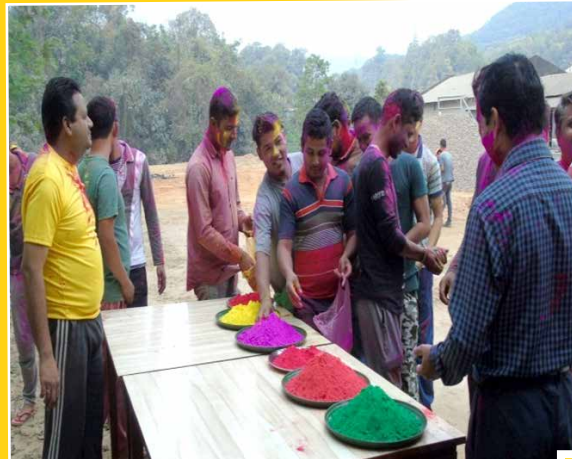
Holi Celebration at Plant