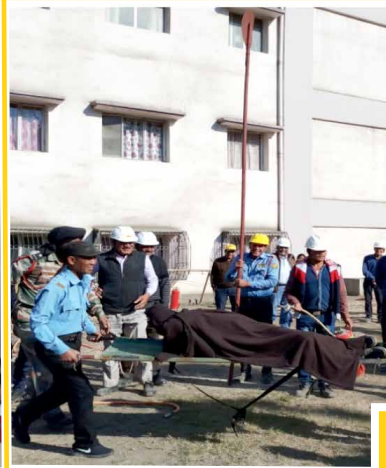
Mock Safety Drill